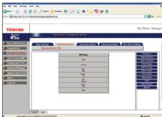
My Phone Manager®

The Strata Media Application Server is one of the first devices that combine voice applications from multiple vendors onto a single platform using Host-based Media Processing (HMP) technology. The advantage of HMP is that it eliminates the need for expensive voice resource boards and provides a sleek, efficient IP-based solution.