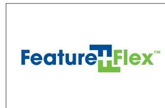
User Adaptable Solutions