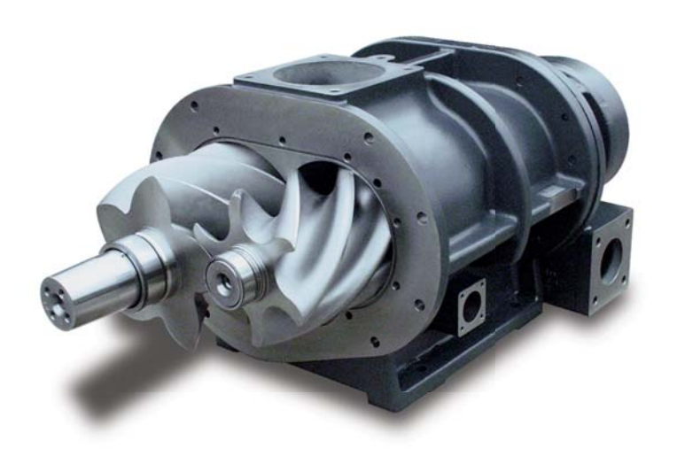
FIGURE 4: Rotary screw compressors have a higher initial purchase price, but can be a long term cost effective solution.

FIGURE 3: CAGI data sheets publish compressor performance information and are verified by third party testing. Manufacturers publish these date sheets on their website. For more information, visit www.cagi.org.