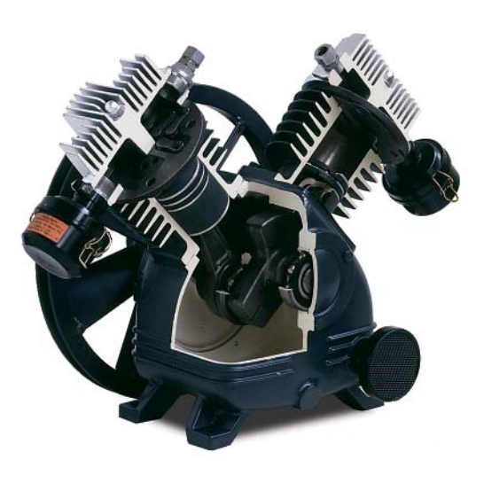
FIGURE 3: Although routine maintenance for piston compressors is inexpensive, they have much higher oil carry-over and have higher operating temperatures.

20 degree (F) increase in temperature doubles air's ability to hold moisture.